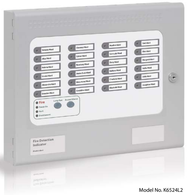
Model No. K6524L2