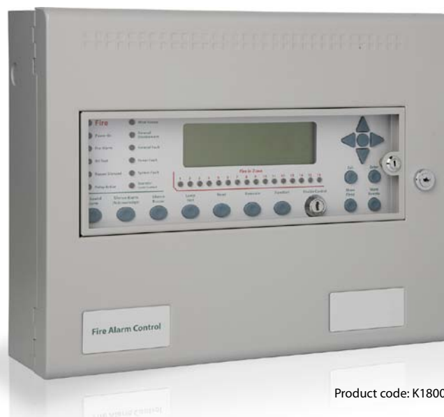
Product code: K18002