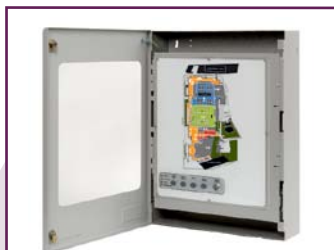
View showing mimic mounted on inner door