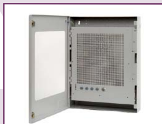
View showing LED grid