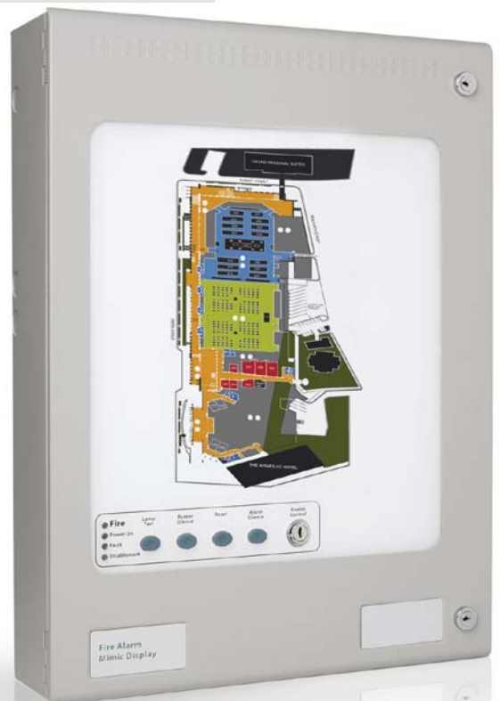
M3 size Syncro Matrix