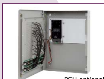
PSU optional View showing internal layout