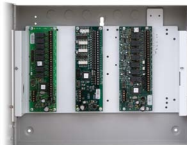
3x I/O boards without PSU