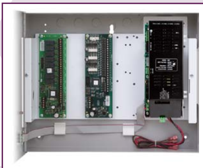
2 x I/O boards with PSU