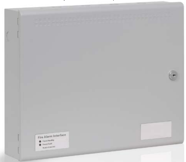
Model No. K16001M2