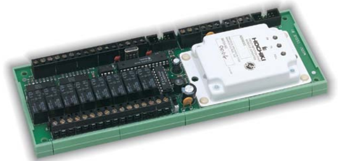
MIOU - Din rail mounting version (K559)