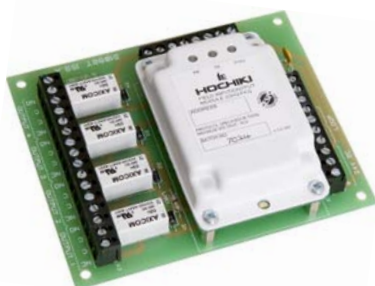
LIOU - Model No. K507

Inputs on MIOU & LIOU are not monitored.